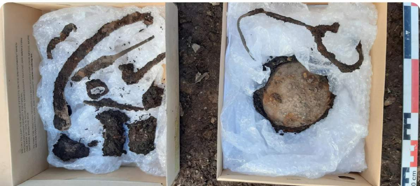
Two cardboard boxes holding metal artifacts found in the Viking Age burial, including knives, a cloak brooch and the remains of a shield.

An amazing discovery was made in the backyard of a house located in the Holmen neighborhood of Oslo. A new house was set to be built on the lot, but before that could happen, archaeologists were called to excavate the site. Their labors were fruitful as they determined there lay a burial site dating back to the Viking Age. Among the items found were gravestones, knives, horse equipment, a cloak ring buckle, and an entire wooden shield. All that was left of the rotted wooden shield was its metal centerpiece. There were no human remains found at the burial site as it was Viking tradition to cremate the deceased on a bonfire. The items found were just underneath the topsoil. Sciencenorway.no reported that about 60 Viking graves have been discovered in Oslo. However, this one is significant in that it was the first excavation by a team of archaeologists, rather than construction workers.